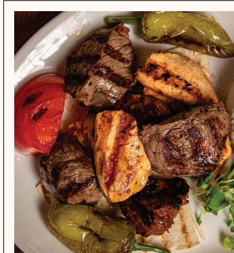
CHEF'S MIX GRILL