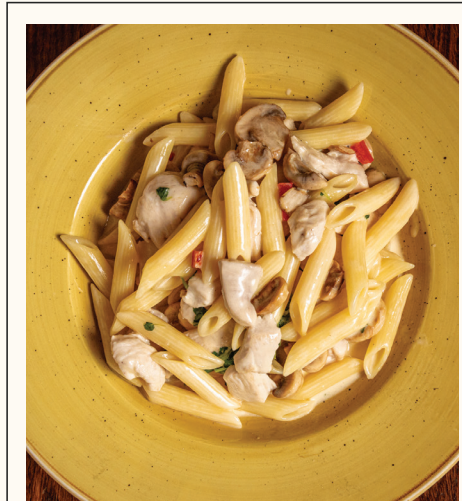
CHICKEN & MUSHROOM