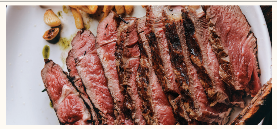
RIB-EYE STEAK 10 OZ