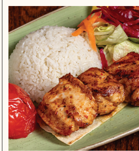
GRILLED CHICKEN SKEWER