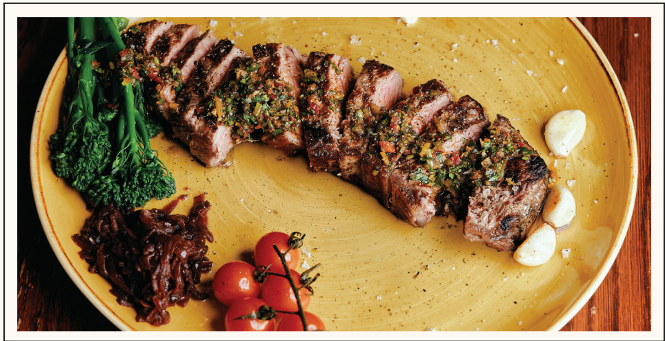
CHIMICHURRI SLICED STEAK 10 OZ

Please speak with your server as our foods may contain the following allergens or dietary indicators: DF (Dairy-Free), V (Vegan), VG (Vegetarian), GF (Gluten-Free), G (Gluten), Se (Sesame), E (Egg), Ms (Mustard), F (Fish), N (Nuts), D (Dairy)