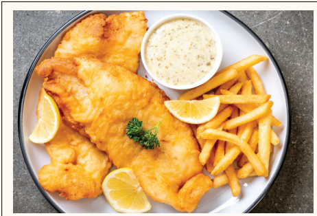
TRADITIONAL FISH & CHIPS