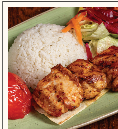
GRILLED CHICKEN SKEWER